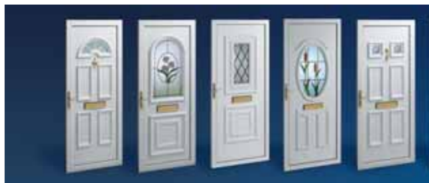
...many more designs available*

*Designs may vary from those shown above.