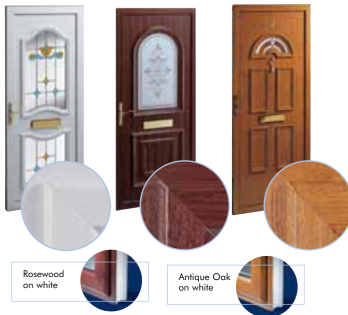
Rosewood on white