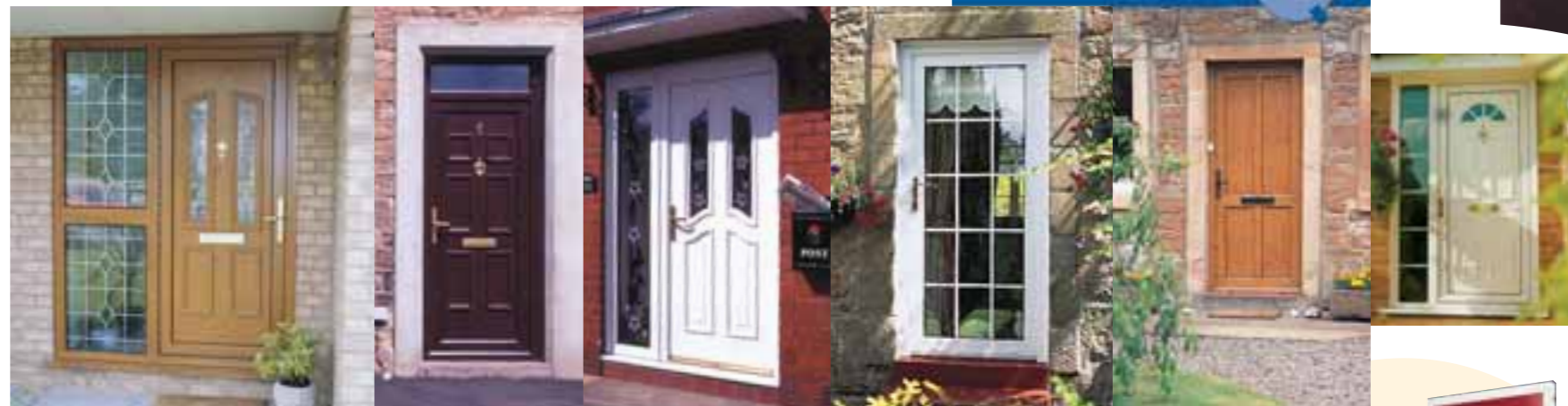
PVCu doors made from PROFILE 22

*Document J in Scotland *Document F in Northern Ireland