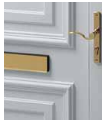
Washable and weatherproof for long lasting good looks.

All in all, it adds up to a warmer, more secure solution and, with hardly any maintenance required and a host of designs and styles to select from, you can be sure that there really is no grander entrance to grace your home!